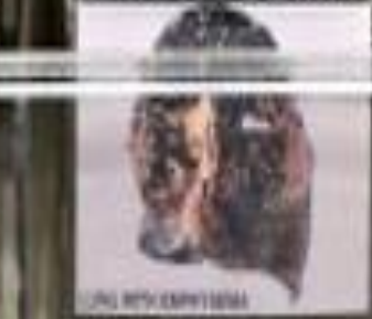
ALL WITH EMPHYSEMA